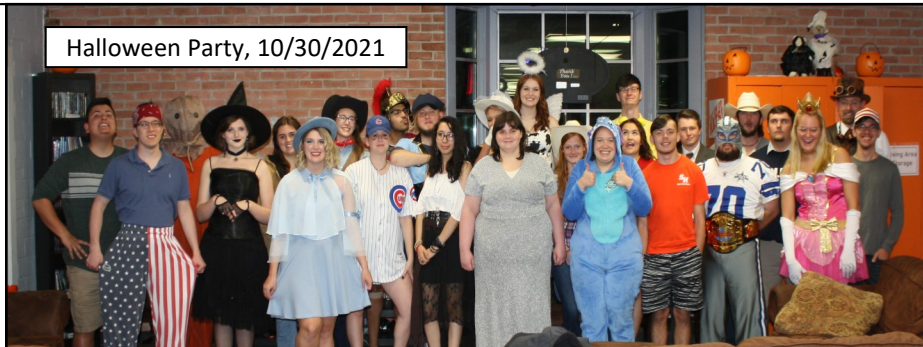
Halloween Party, 10/30/2021