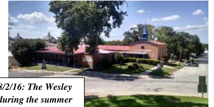
8/2/16: The Wesley during the summer